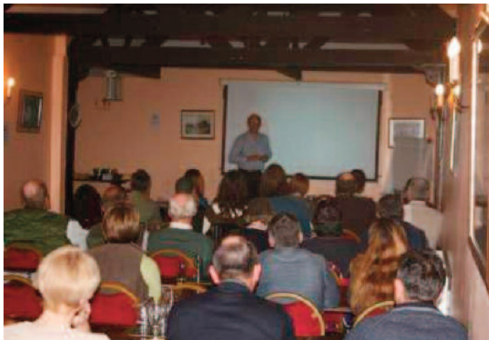
Seminars have average attendances of over 30 across all the RDA regions

The training has covered the key livestock species. As the programme has developed a veterinary based animal health resource has been produced, covering all the conditions that affect UK livestock, providing a unique training resource for livestock keepers.