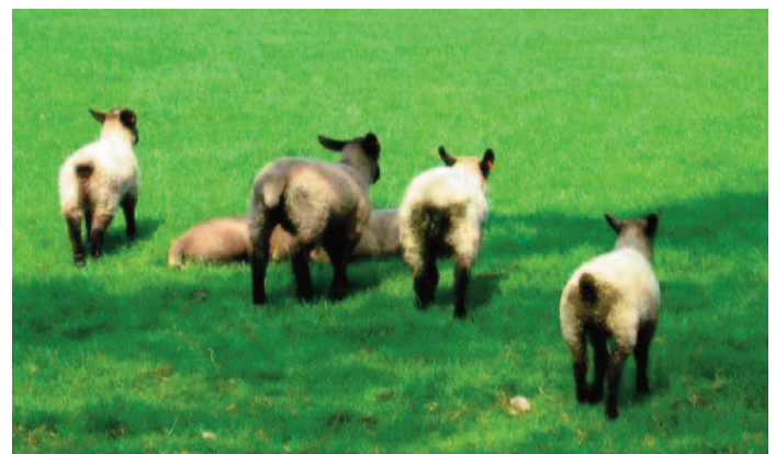
Scour in lambs during June, maybe caused by internal parasites, principally Nematodirus and Teladorsagia . If the problem is not addressed, this may lead to losses and long-term poor growth rates.

Endoparasites cost the UK sheep industry £84m annually and the problem of anthelmintic resistance is increasing. Recent research (Gerald Colles 2010) suggests that only 15% of farmers understand the SCOPS recommendations. NADIS publishes a monthly parasite forecast based on detailed Met Office data for the 10 weather regions of the UK. The Parasite Forecast highlights the likely parasitic challenge to livestock in the regions and emphasises the SCOPS recommendations in a practical context. Specific forecasts are published for fluke and nematodiosis at strategic times of the year