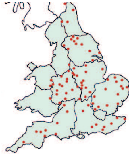
Distribution of practices delivering NADIS knowledge transfer training

The NADIS training is inclusive, so all practices no matter their size can take part. So far over 90 practices have enrolled to provide training across the RDA regions. Many of these practices have not regularly been involved with training in the past. NADIS provides the material in ready to use PowerPoint presentations to facilitate delivery for participating practices. New updates are sent to practices every 3 months so the presentations always contain the latest training material. This provides the opportunity for livestock keepers who have not previously had access to veterinary based animal health training to receive training from their veterinary surgeon and engage in continuing professional development. The NADIS distribution of training practices covers all the RDA regions and new practices are continually being recruited providing a nationwide network of veterinary practices actively engaged in training their clients in veterinary based animal health.